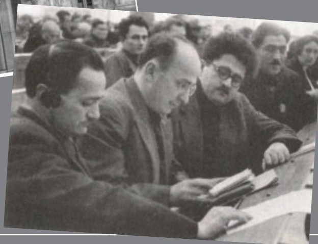
Right: Stalin's notorious henchman Lavrenti Beria (middle) sits alongside Aghasi Khanjian, head of the Armenian Communist Party, circa 1935.