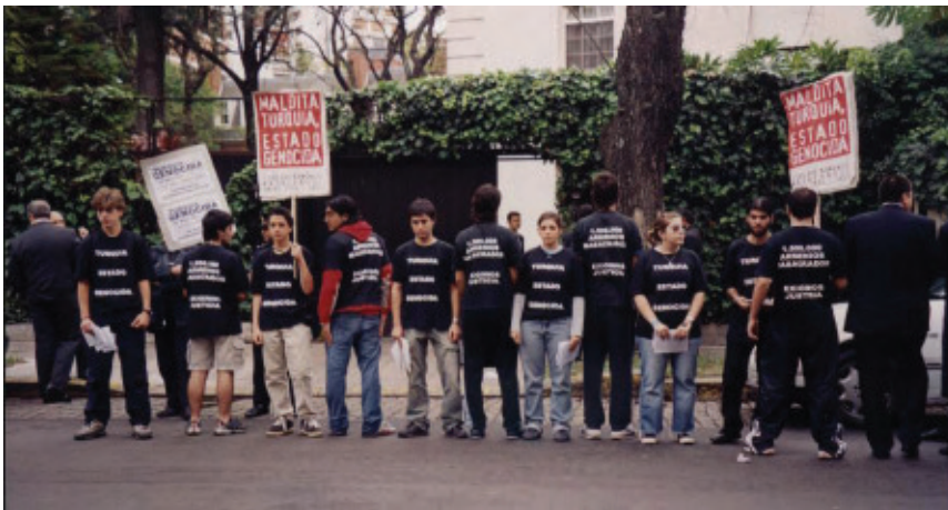
UJA members demonstrating in front of the front of the Turkish ambassador's residence on October 29, 2004.

By 2002, the tide began to turn and there was a rejuvenation of UJA activism in the region. Many chapters saw an influx of new members and a reinvigorated spirit of commitment to the Armenian community. In my