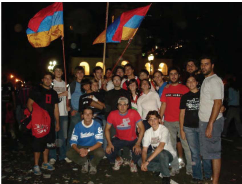
UJA members demonstrate against the tortured and disappeared in Buenos Aires on March 24, the day marking the 1976 right-wing military coup which ushered in seven years of dictatorship and state terror in Argentina.

In the area of communications, our regional media is also growing through the use of new mediums and resources. For example we have a blog,