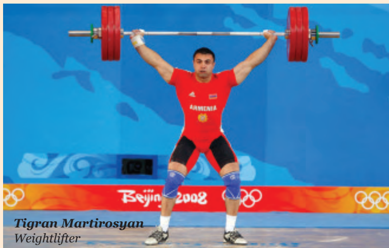
Tigran Martirosyan Weightlifter

It is for this reason that we must be proud of our Olympic athletes. And it is for this reason we must cheer, shout and rejoice when we see our colors displayed on an international stage.