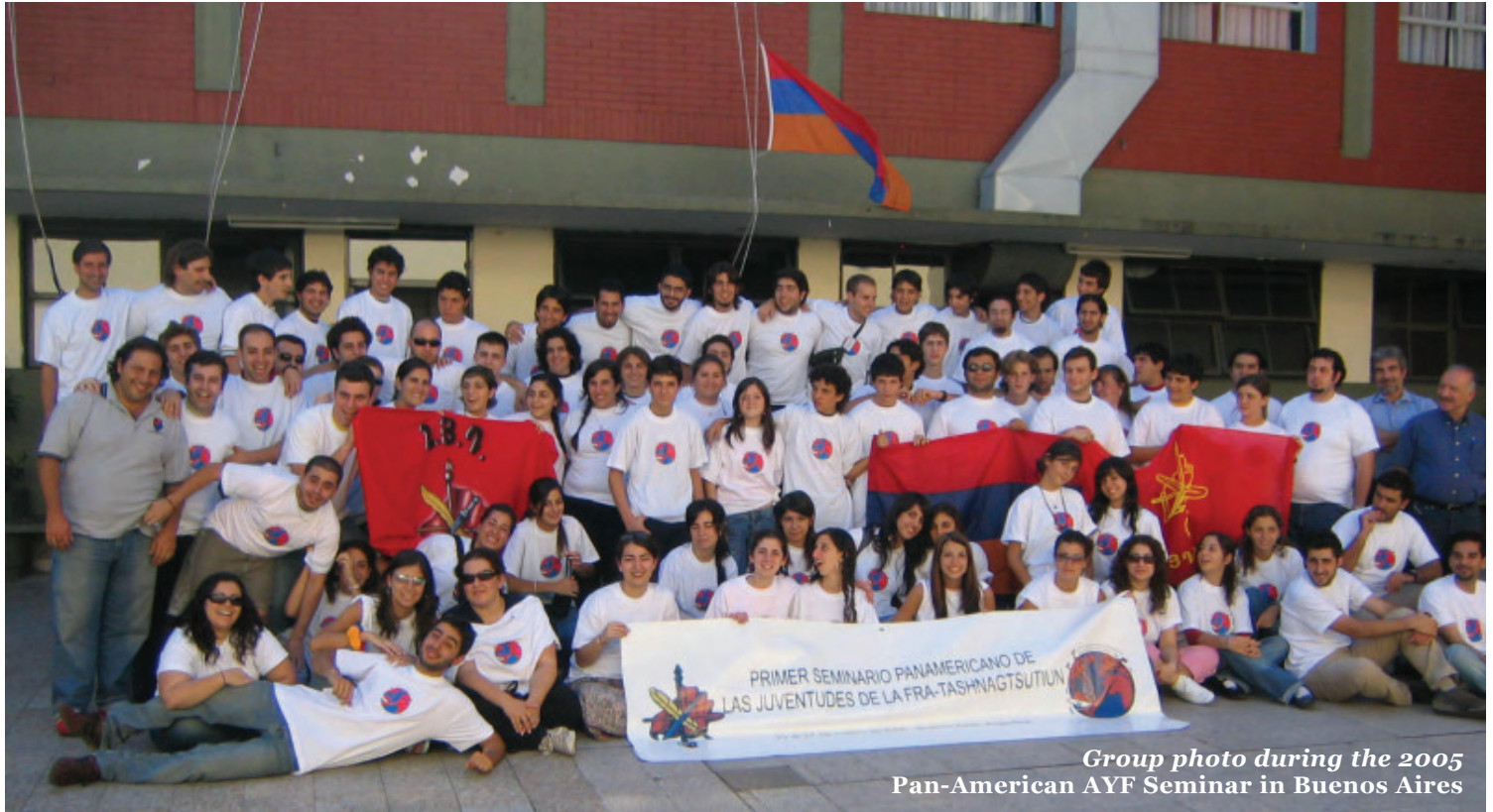
Group photo during the 2005 Pan-American AYF Seminar in Buenos Aires

yeridasartagan.blogspot.com, where we upload documents, speeches and different things that may interest the youth. The same is true of our web page, www.ujafra.org (currently being updated). What's more, we have our magazine Gamk which is published twice a year. In it we try to deal with topics related to Armenia, Argentina, human rights and world events. In our blog, we feature various issues of Gamk in digital format in order to extend our mission to as many people as possible.