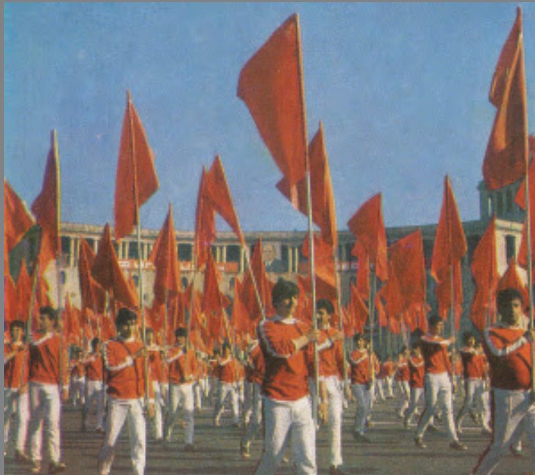
May Day parade in Yerevan during Soviet times.

Achieving such progress will require not only a proper understanding of history but, more importantly, the willingness to change it.