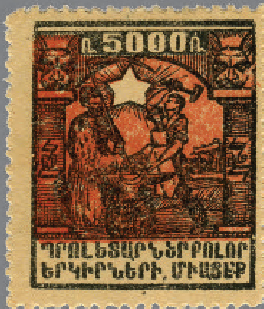
A Soviet era Armenian stamp which features Karl Marx's famous rallying cry, "Workers of the world, unite!"

Thus, getting by in the Soviet system inherently required political influence, social connections, and personal networks. The totalitarian, top-down nature of management also led to the wasteful distribution of supplies and constant shortages. People were conditioned to set aside national concerns and look out, instead, for their own narrow personal and familial interests.